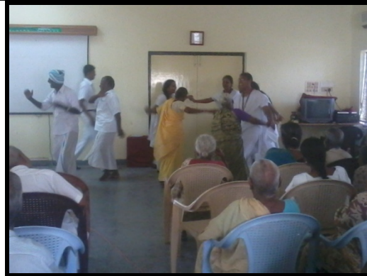
Annai thersha nursing college student participated culture programme.