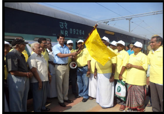
Pudhucherry district collector flag of delhi tour