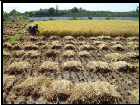
Tev department paddy cultivation