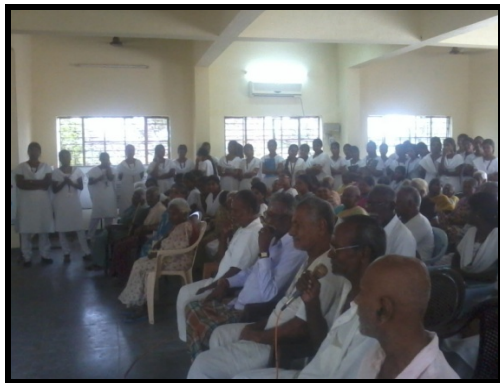
Annai thersa nursing college student visit TEV asking elder health status.