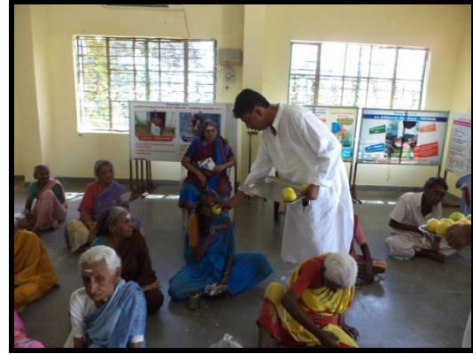
Festival for vinayar sadhurithi celebrate give fruits and snack for DPD.