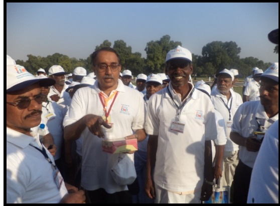
Help Age India CE to ask about elder vakkadhan progarmme, then sweets with snacks given