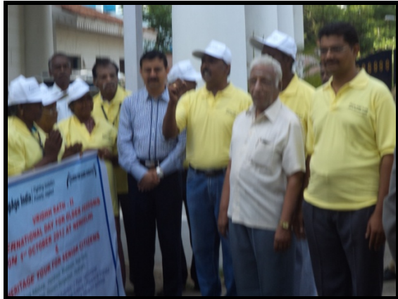
Cuddalore district collector flag of Delhi tour